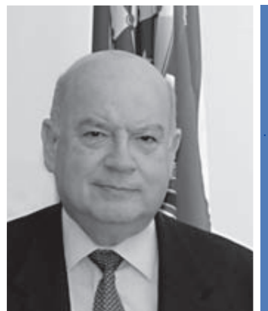
SECRETARY GENERAL OF THE OAS José Miguel Insulza

Antigua and Barbuda Argentina Bahamas Barbados Belize Bolivia Brazil Canada Chile Colombia Costa Rica Cuba Dominica Dominican Republic Ecuador El Salvador Grenada Guatemala Guyana Haiti Honduras Jamaica Mexico Nicaragua Panama Paraguay Peru Saint Kitts and Nevis Saint Lucia Saint Vincent and the Grenadines Suriname Trinidad and Tobago Uruguay United States Venezuela